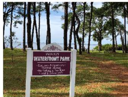
Additional Outside Parking beyond the Cove Club