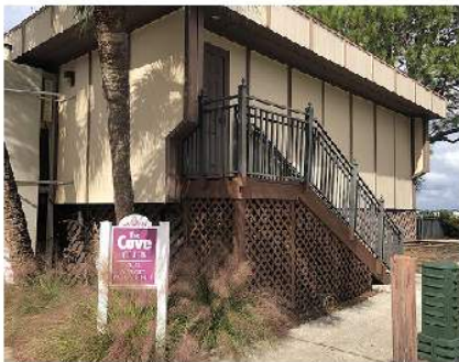
Look for this sign.